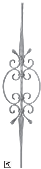
mm 210 x 1000 h Art. 8220 ■ 12 x 6 ■ 12