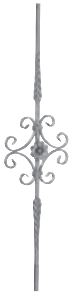
mm 210 x 1000 h Art. 8230-025 ■ 12 x 6 ■ 12 Art. 8230-026 ■ 12 x 6 ■ 14